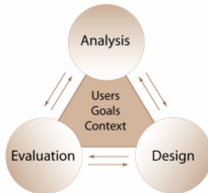
Fig. 1. The user centred design approach

When using the user centred design approach we start from the users, determine their present needs and expectations and convert them into an appropriate user interface design [6] (see the following figure). The interface of an application will offer different levels of access (e.g. simple and expert search) always trying to morph into a self explanatory interface characterized by minimal usage of technical language.